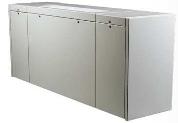
Horizontal Unit Ventilators