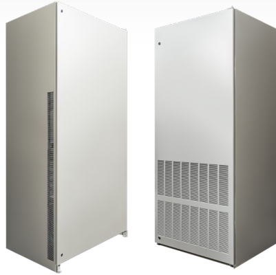
Classmate, Schoolmate and Sentinel Units