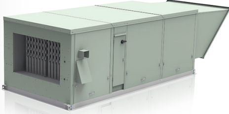
Direct and Indirect Make-up Air Systems